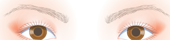
Upper Midbrain (Tectum) Dysfunction Large, Fixed