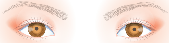
Metabolic Imbalance Small Reactive, Regular