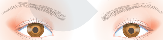
Midbrain Dysfunction Midsized & Fixed